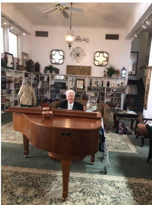
Hotel Piano Player